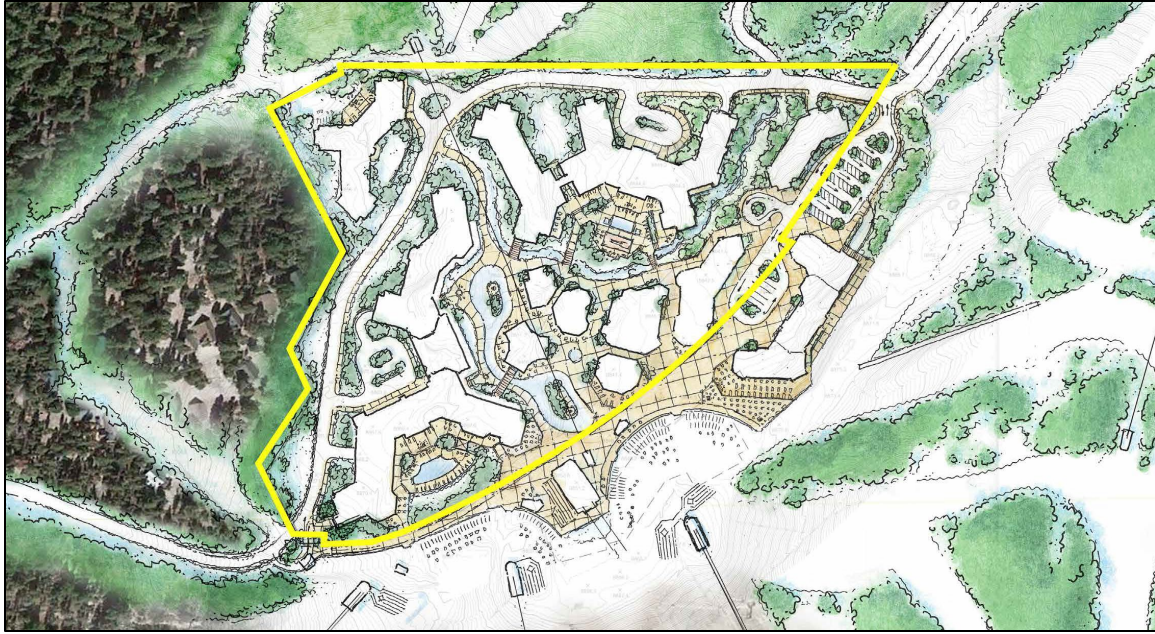
Figure 3: Parcel A Site Plan

A hotel at the southwest corner of the site grounds the opposite end of the “ski beach” at the confluence of the chairlifts, and a Residents’ Club, second hotel, and additional condos throughout the site provide opportunities for varying levels of ownership, with club amenities and programming. Family-focused condo residences on the hilltop at the northwest corner of the parcel tie directly into the kid-friendly terrain connecting to the “Ski Ranch” with several new ski runs and a pulse gondola to Parcel B. The expanded food and beverage options paired with fragmented buildings activate the pedestrian corridor and create a small-town village feel that optimize views up the mountain.