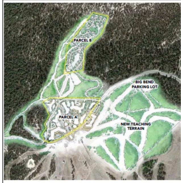
Figure 2: Parcel Map

The proposed plan combines overnight accommodations, residential real estate, retail, food and beverage options, and facilities for skiers and summer visitors. As part of these improvements, Minaret Road (State Route 203) is proposed to be realigned along the northern edge of Parcel A to facilitate direct connection of the MMSA permit area to the new village. Supporting improvements are proposed on USFS permit land, including reconstruction of the existing Main Lodge skier services facility, a new visitor parking lot, a new pulse gondola, and additional ski trails. An updated Master Development Plan (MDP) is being processed by the USFS to characterize these related improvements in more detail.