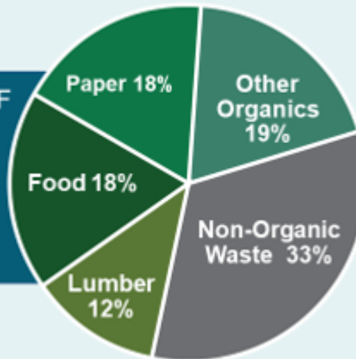
California's Waste Stream

CALIFORNIA DISPOSED OF APPROXIMATELY 27 MILLION TONS OF ORGANIC WASTE IN 2017