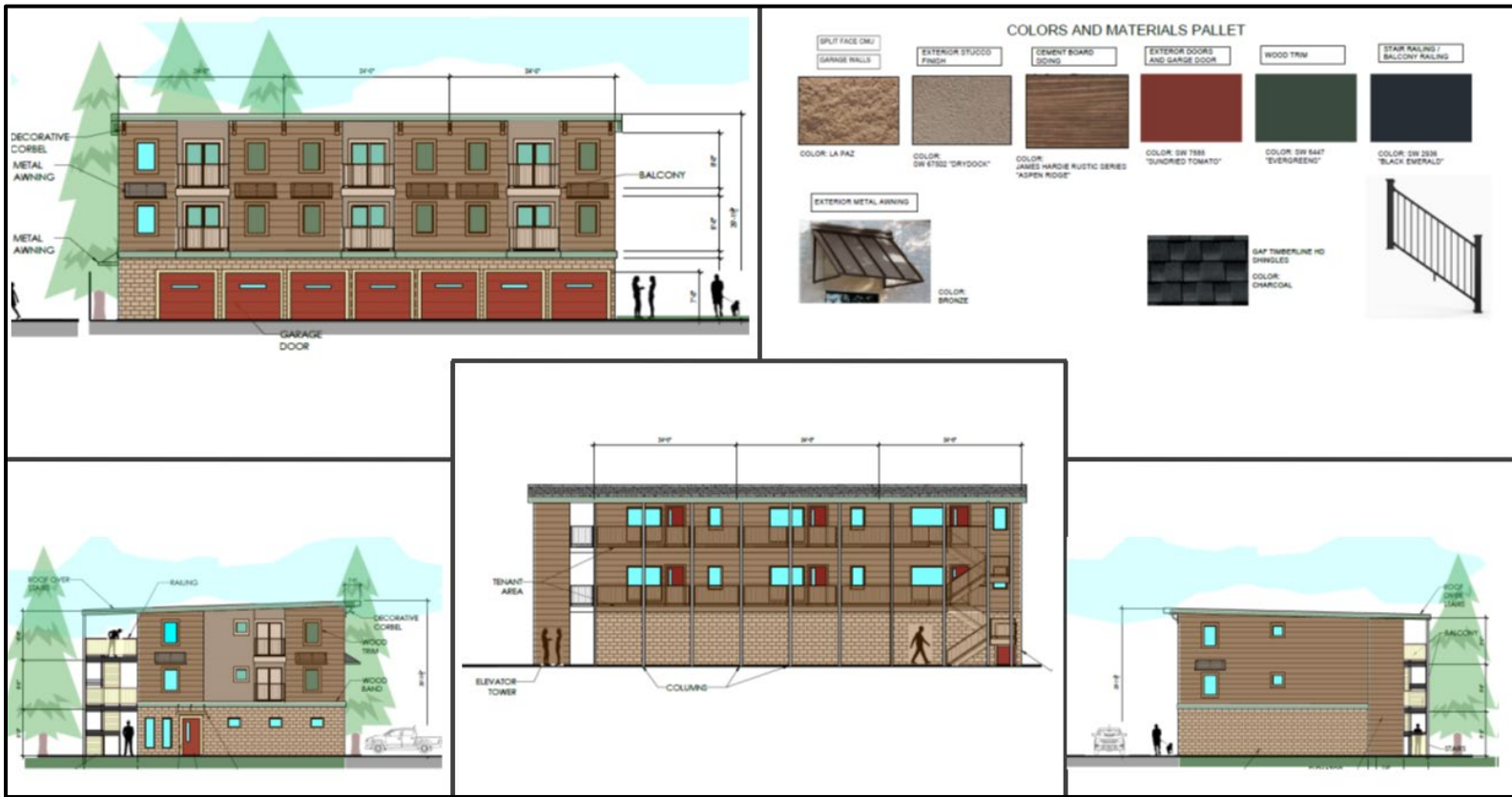
Figure 1: Building Elevations, Colors, and Materials