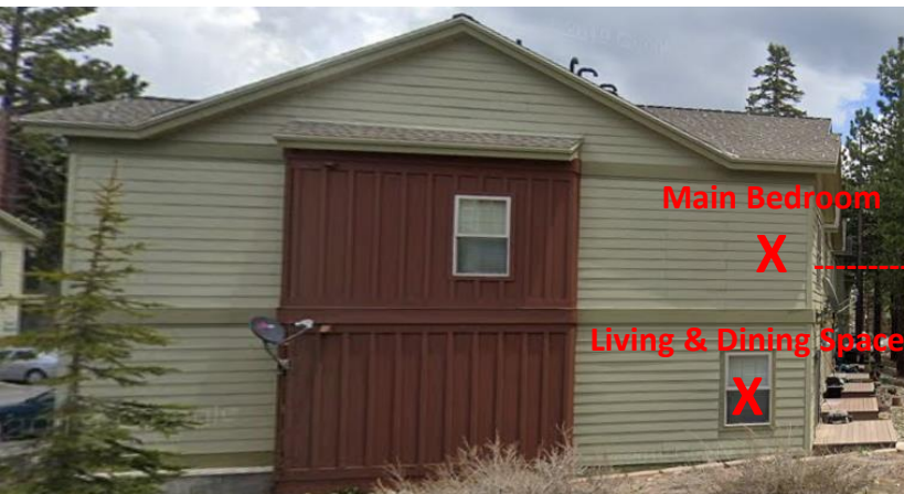
San Joaquin Villas (SJV) Bldg E