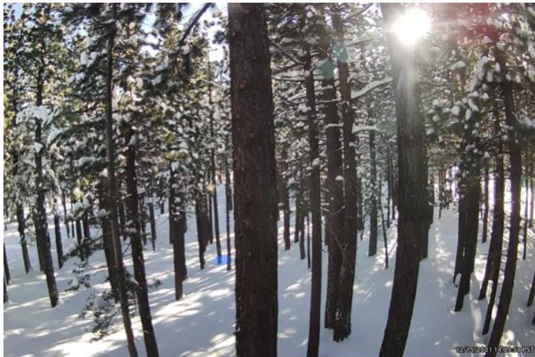
Photo of South from back of SJV Bldg E. Dec. 15, 2022 2pm