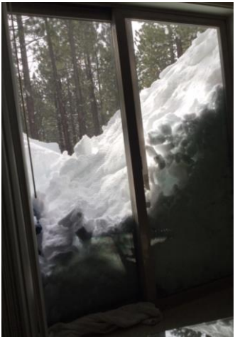
Back yard & deck of SJV's E Bldg (photos from inside).