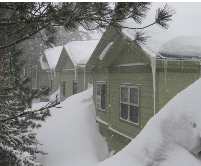
Backside of SJV's E Building. Shown are 2 nd floor windows. Snow piled over 20 feet above the ground. Photo taken from top of snow storage area at the end of Callahan Way (to be replaced by Villas III entrance).