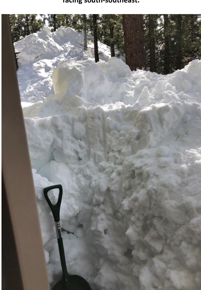
San Joaquin Villas E2. My back deck, facing south-southeast.