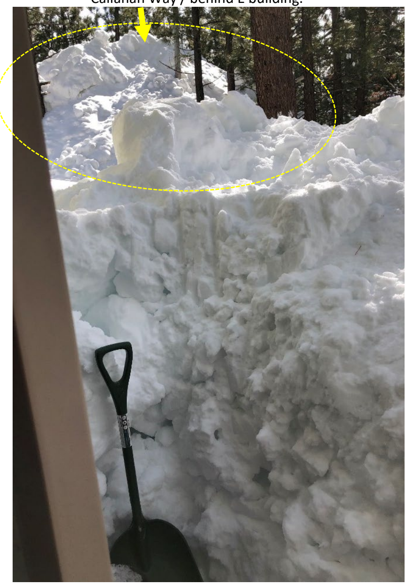
SJV E2. My back deck, facing south-southeast. 30' tall pile of snow storage at end of Callahan Way / behind E building.