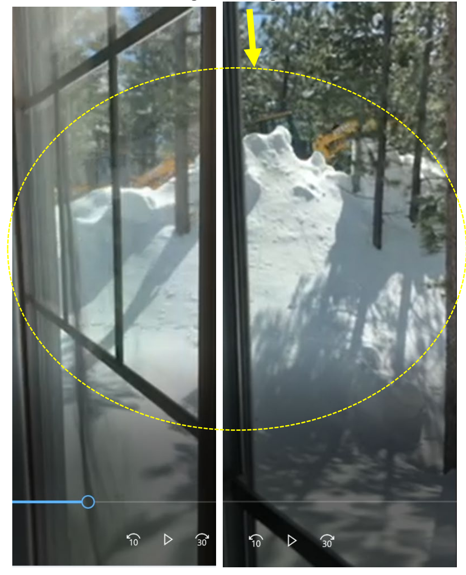
SJV E2 from 2<sup>nd</sup> Floor bedroom. Facing south-southeast at 30' tall pile of snow storage at south end of Callahan Way / behind SJV. (2 clips below are from 1 video I took of Loader moving snow further behind SJV E building). This snow storage for Callahan Way is about 100 feet long, 30 feet high, and 35 feet wide.