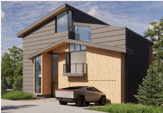
Figure 1: Front Rendering of Lot 1