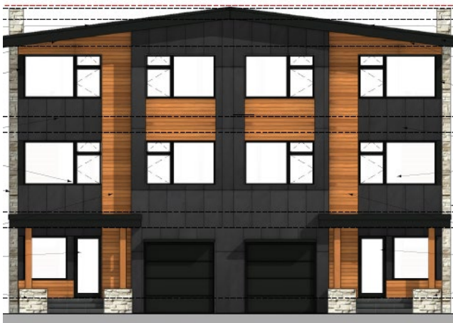
Figure 7: Front Rendering of Lots 4-33