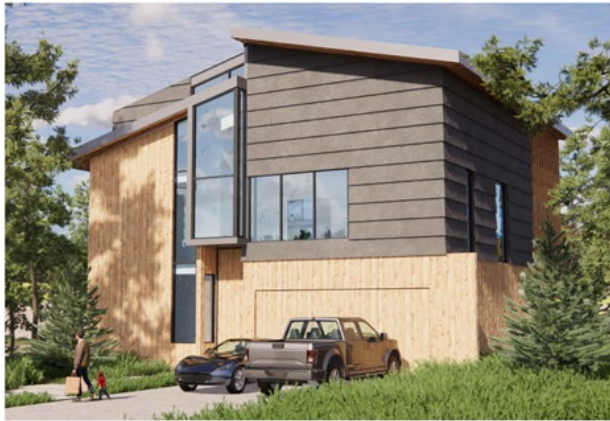
Figure 5: Front Rendering of Lot 3