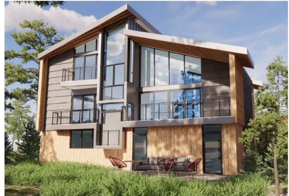
Figure 2: Rear Rendering of Lot 1