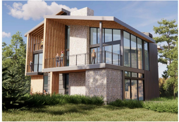
Figure 6: Rear Rendering of Lot 3