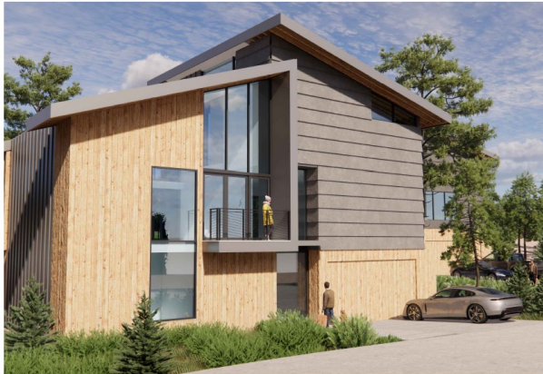
Figure 3: Front Rendering of Lot 2