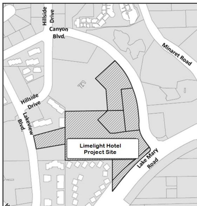
Figure 1: Project Site.

The project site, shown in Figure 1 below, is currently vacant and consists of seven contiguous parcels. Table 1 provides information on surrounding land uses and zoning.