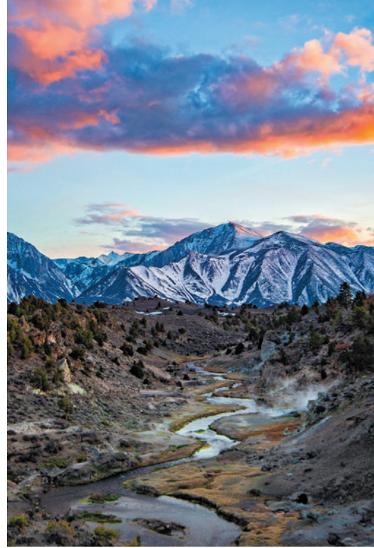
HOT CREEK GEOLOGICAL SITE © DAKOTA SNIDER • DEVILS POSTPILE NATIONAL MONUMENT © ROBERT ROHRER / SHUTTERSTOCK.COM • FAMILY AT RAINBOW FALLS © MAMMOTH LAKES TOURISM • HIKER AND DOG, ROCK CREEK CANYON © MONO COUNTY TOURISM • FALL COLOR PHOTOGRAPHER © MAMMOTH LAKES TOURISM • FIREFORKS AT THE VILLAGE AT MAMMOTH © MAMMOTH LAKES TOURISM • HORSEBACK TOUR © MAMMOTH LAKES TOURISM • LAKE GEORGE, MAMMOTH LAKES BASIN © DAKOTA SNIDER • LAKES BASIN TROLLEY © EASTERN SIERRA TRANSIT AUTHORITY

Downstream, Rainbow Falls drops over 30 m (101 ft) and is named for the colorful rainbows reflected in the mist by the midday sun.