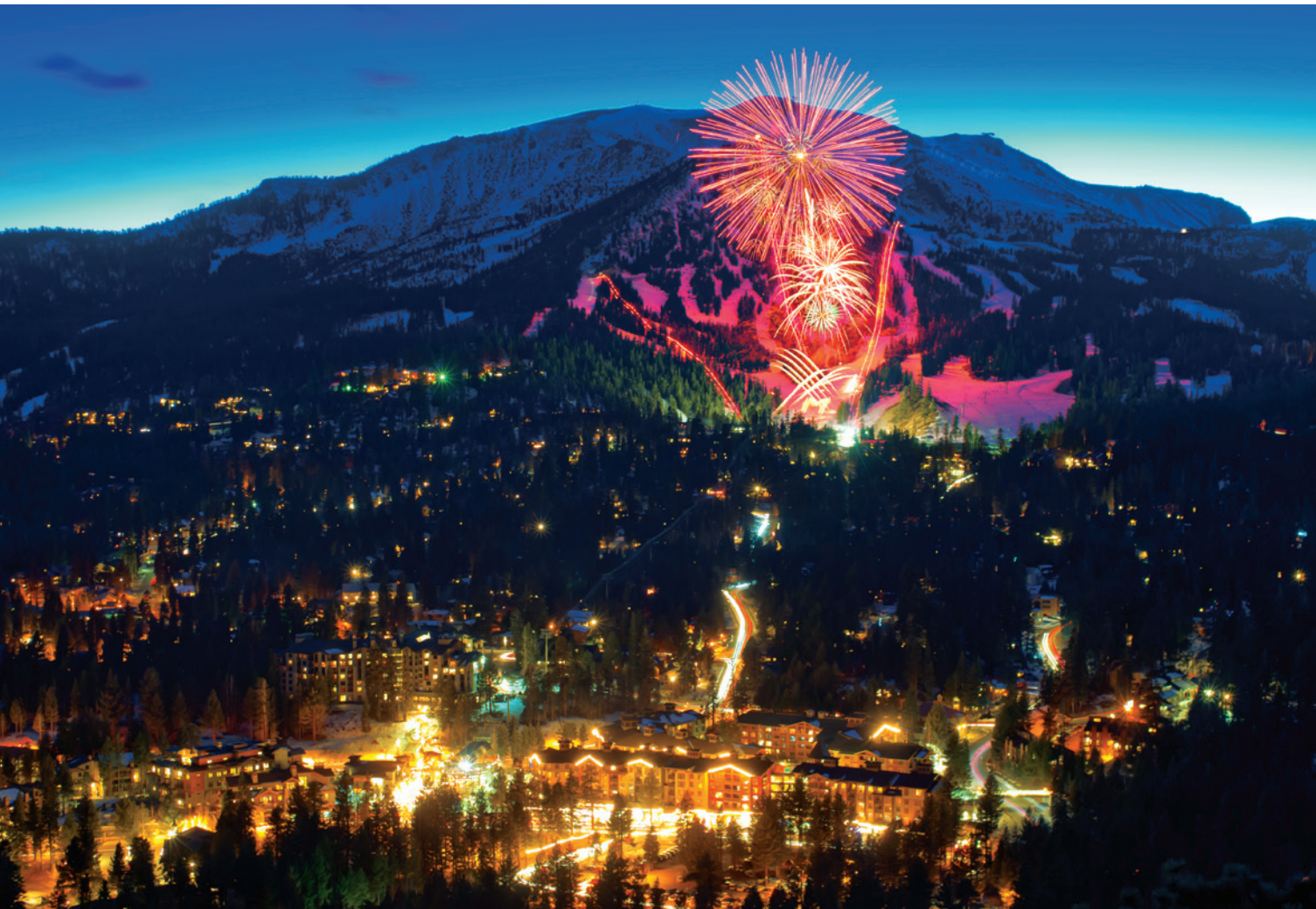
SKIING ON MAMMOTH MOUNTAIN © DAKOTA SNIDER • ANNUAL NIGHT OF LIGHTS ON MAMMOTH MOUNTAIN © PETER MORNING / AMKSA WOOLLY'S TUBE PARK © KEVIN WESTENBARGER • SKI SCHOOL © PETER MORNING / AMKSA • MAMMOTH MOUNTAIN SUMMIT © PETER MORNING / AMKSA

Lessons are available at each base lodge for all levels. Please note that Main Lodge has the most ideal beginner lift and terrain for first-time skiers and snowboarders.