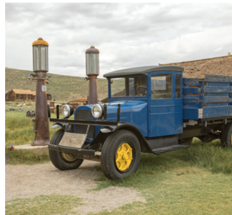
BODIE HOUSE INTERIOR © JEARWEBB / ADOBE STOCK • BODIE GENERAL STORE © BETTY SEBERQUIST / ADOBE STOCK • BODIE TRUCK © KARENFOLEYPHOTO / ADOBE STOCK MAIN STREET IN BODIE © JOSH WRAY / MAMMOTH LAKES TOURISM • BODIE STAMP MILL © JOSH WRAY / MAMMOTH LAKES TOURISM • BODIE AUTOMOBILE © JEFF SULLIVAN