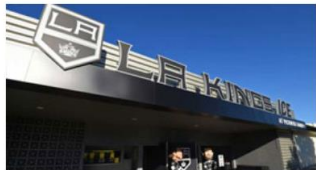
LA Kings Ice at Pickwick Gardens Burbank, CA