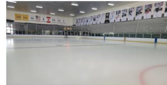
LA Kings Ice at Promenade on the Peninsula Palos Verdes, CA