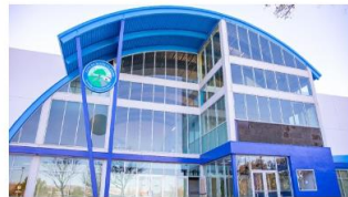
The Cube Ice and Entertainment Center Valencia, CA