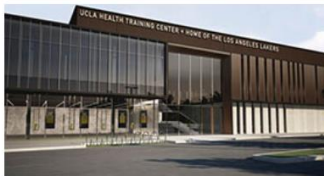
UCLA Health Training Center El Segundo, CA