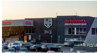
Toyota Sports Performance Center El Segundo, CA