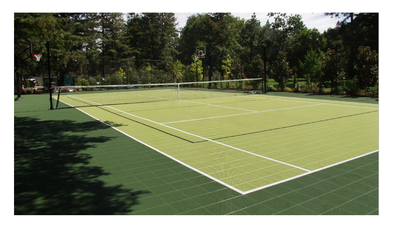
B. <u>Installation of 6 regulation Pickleball Courts on the District/MCOE Ice Rink/RecZone site</u>

An example of a completed tennis court with the Sport Court surface.