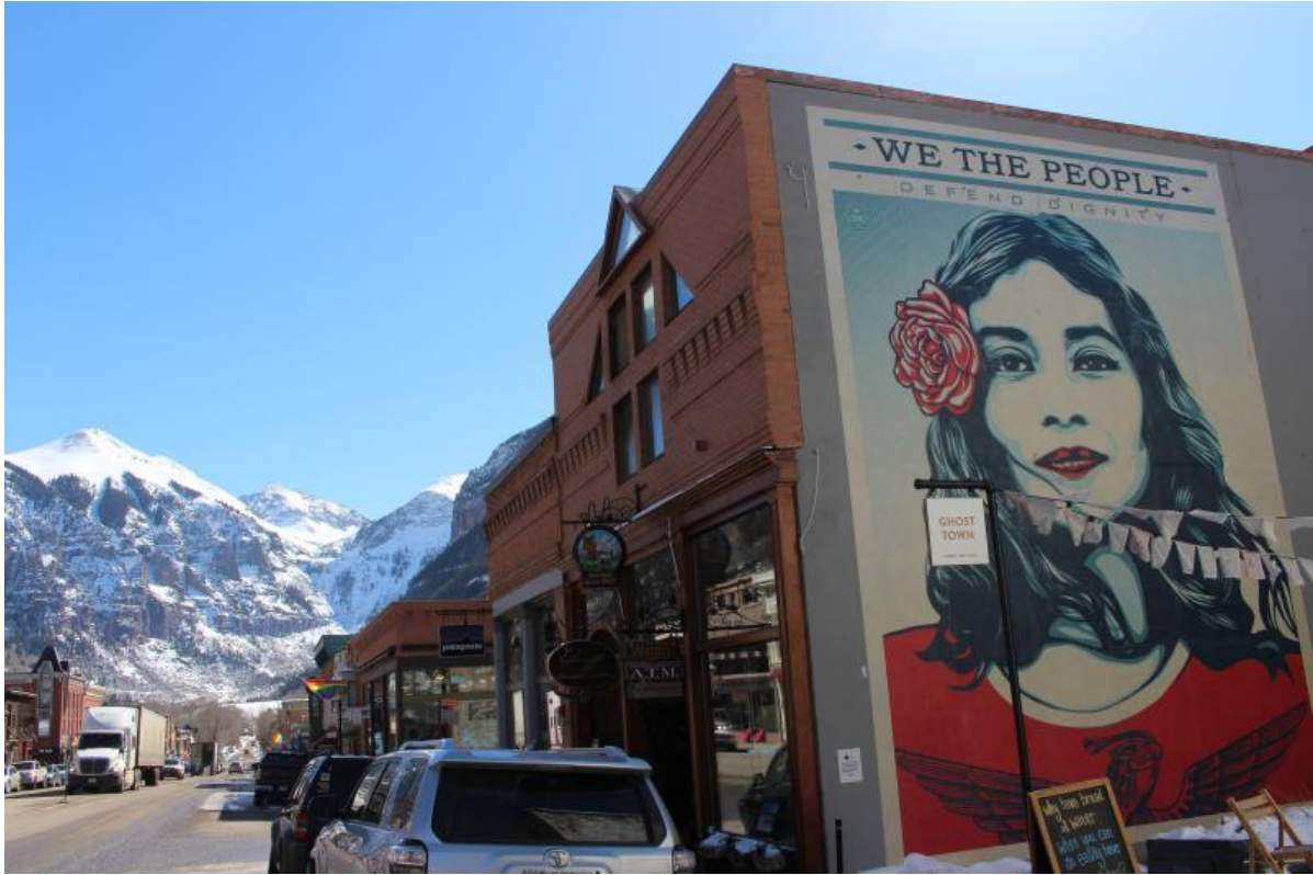
Image 1: "Paste-up" mural example "We the People" by Shepard Fairey in Telluride, CO