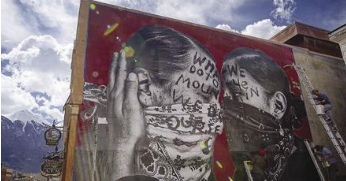
Image 2: "Paste-up" mural "What We Do to the Mountain, We Do to Ourselves" by Chip Thomas in Telluride CO