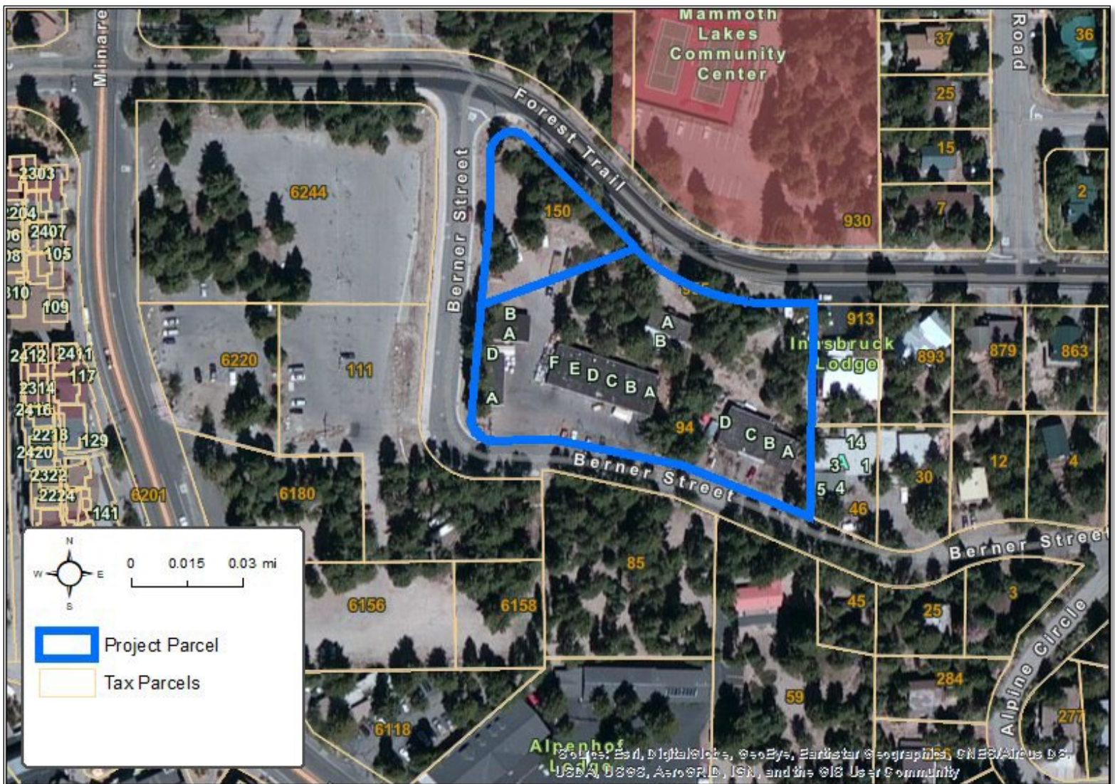
Figure 1 – Project Location Map

The subject property shown in Figure 1 below, is located at the southeast corner of Berner Street and Forest Trail and is developed with four commercial/light industrial buildings, and one unoccupied residential structure. All existing structures and surface parking would be demolished to accommodate the proposed hotel development.