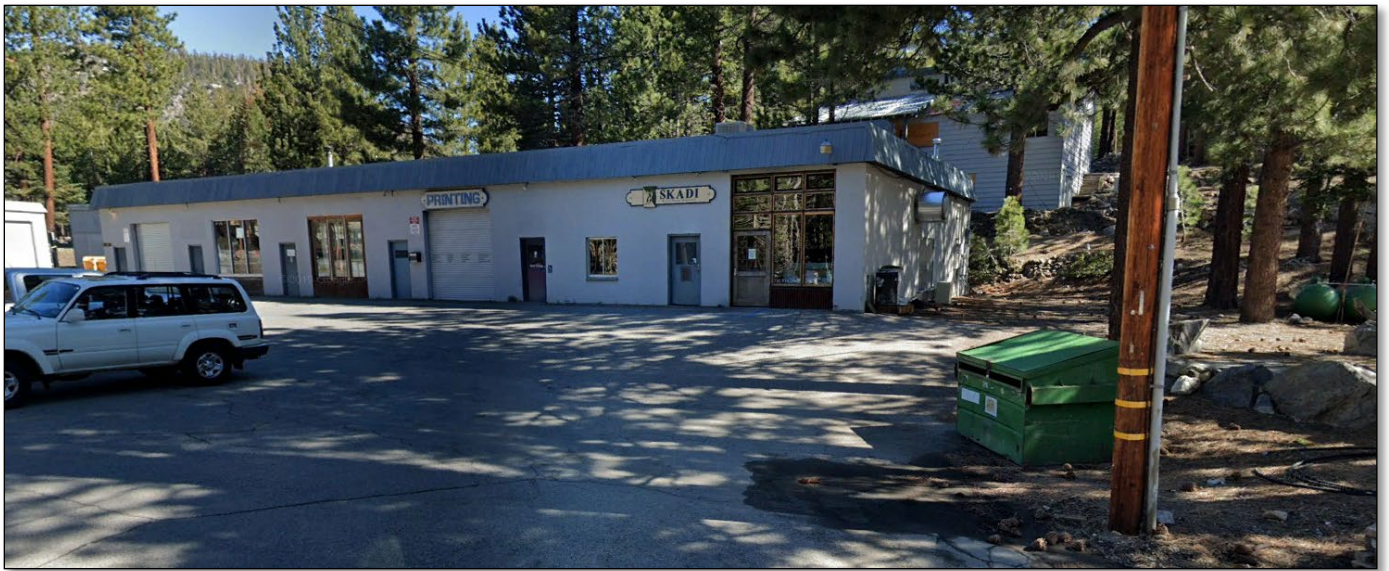
PROJECT SITE EXISTING DEVELOPMENT LOOKING NORTH FROM BERNER STREET