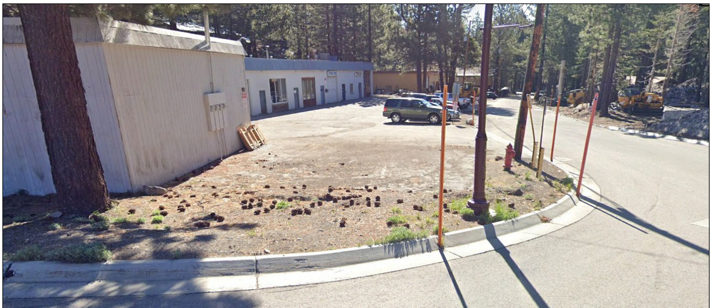
PROJECT SITE – SOUTH/WEST CORNER LOOKING EAST