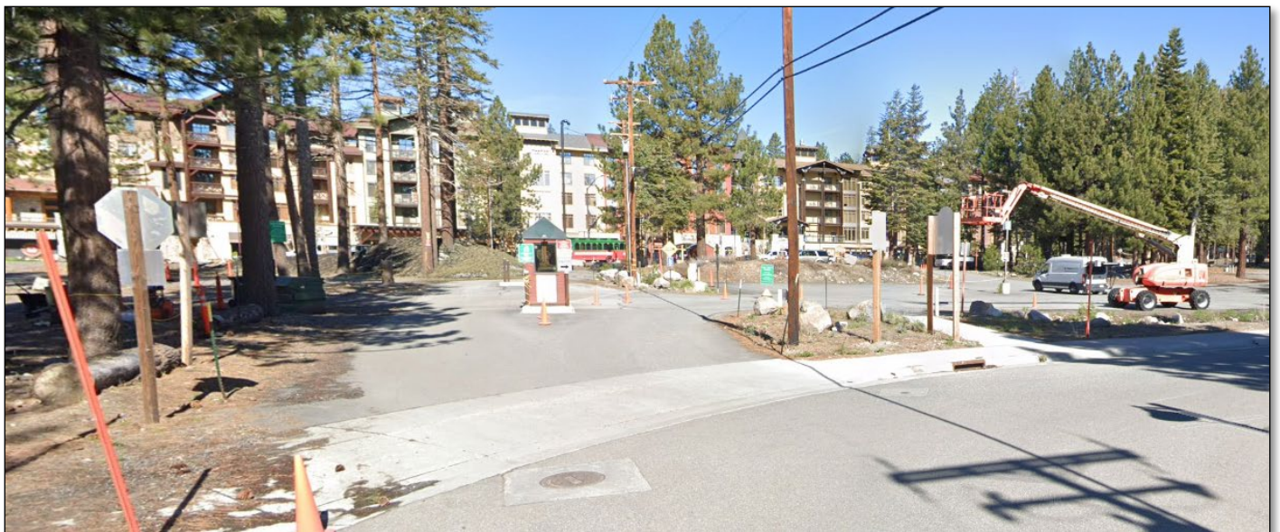
EXISTING PEDESTRIAN LINKAGE (PEDESTRIAN EASEMENT) TO THE VILLAGE THROUGH THE BERNER STREET PARKING LOT