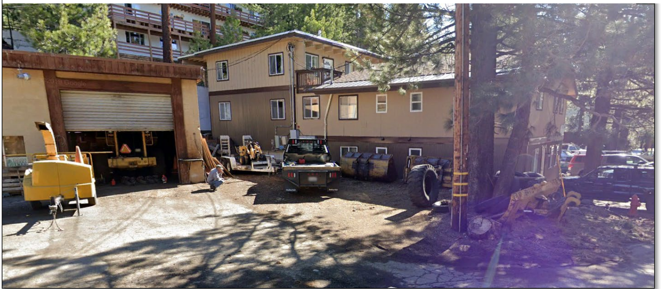
CURRENT INDUSTRIAL USE ON THE PROJECT SITE AND ADJACENT PROPERTY TO THE EAST- KITZBUHEL APARTMENTS