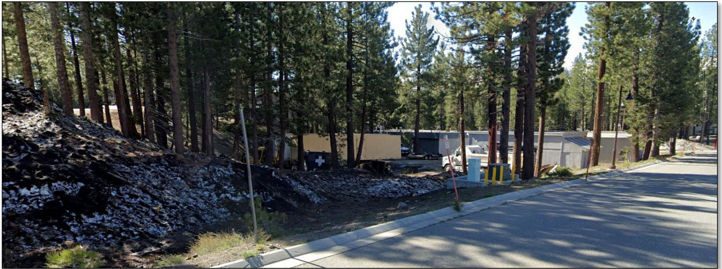
PROJECT SITE FROM THE INTERSECTION OF BERNER STREET AND FOREST TRAIL