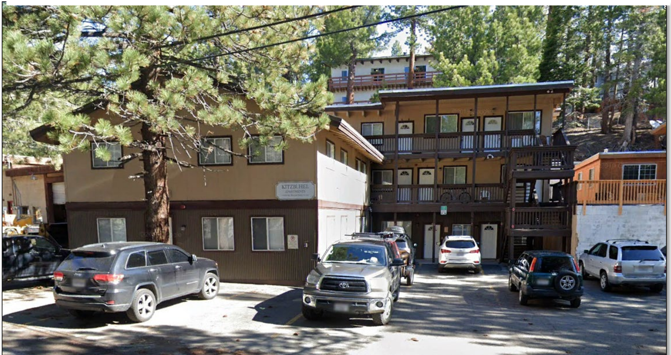
ADJACENT PROPERTY TO THE EAST- KITZBUHEL APARTMENTS