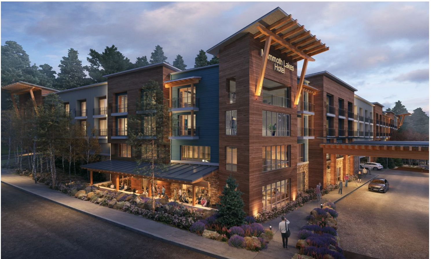
RENDERING OF HOTEL - SOUTHWEST CORNER

The design of the structure combines a contemporary building form with mountain lodge architectural details including exposed wood beams, wood struts, a stone building base material and composite wood-like siding. Three corners of the hotel feature an embellished "tower", designed with an upward sloping shed roof supported by substantial wood struts. Additional shed roof elements featuring wood beams and exposed rafters are provided to shelter hotel room balconies, as well as at the outdoor patio and porte-cochere design.